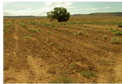
Prolonged drought conditions can cause severe damage to croplands.